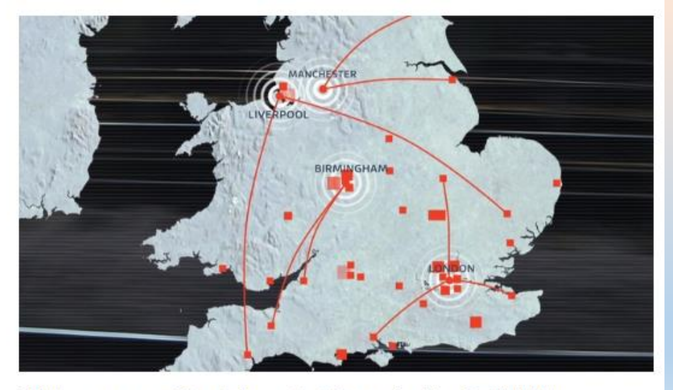
Children as young as 12 are being sent out from major cities.